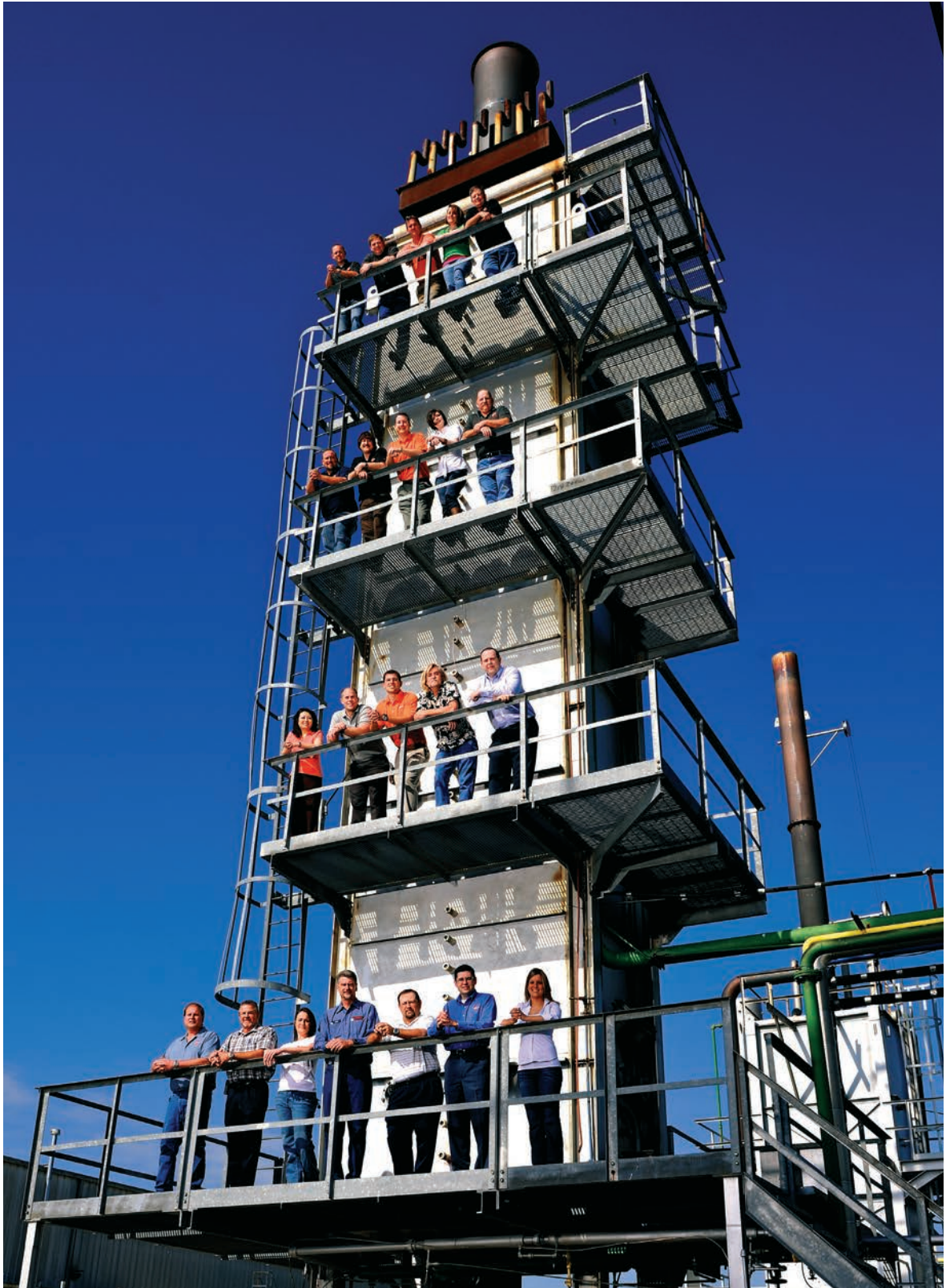
Zeeco's aftermarket products and services team

Our products are only part of the equation. It is the people behind the products – engineers with extensive combustion experience – that elevate our aftermarket group from the role of a mere supplier to that of a true partner in your long-term success.