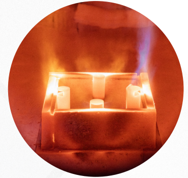
100% H 2