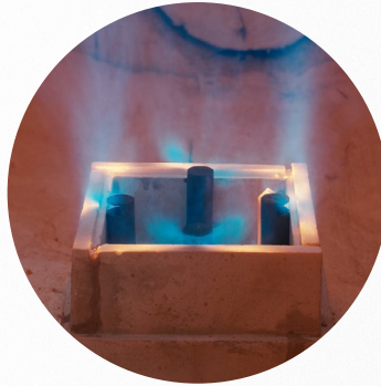
50% NG, 50% H 2