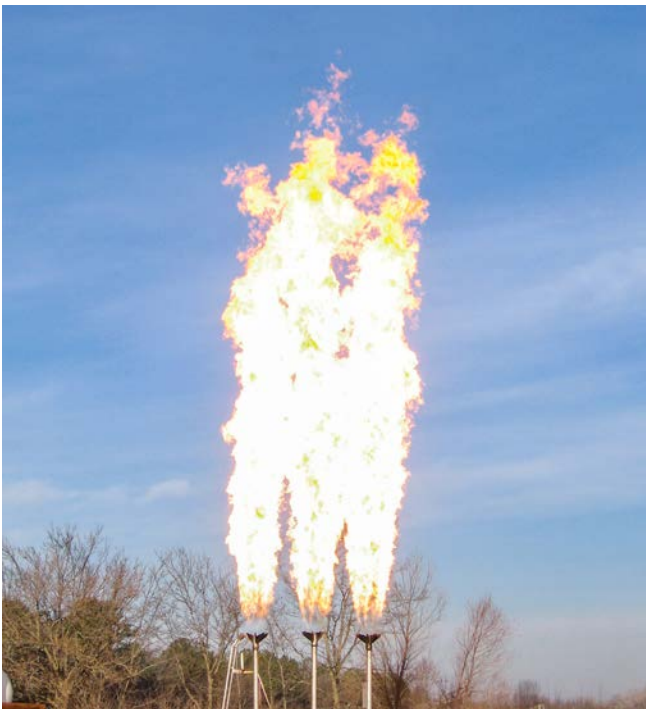
100% Xylene Testing in Zeeco's Test Facility