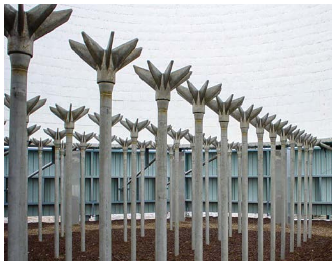
Enclosed Ground Flare with Interior Chamber Cast