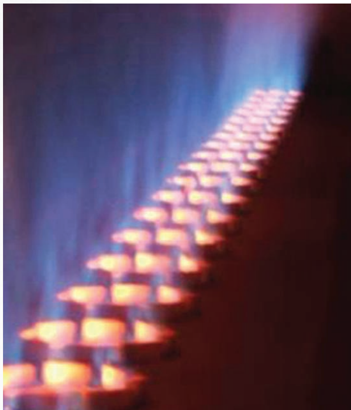
GLSF Min-Emissions Round Flame Gas Burners

BURNERS | FLARES | THERMAL OXIDIZERS | VAPOR CONTROL | RENTALS | AFTERMARKET