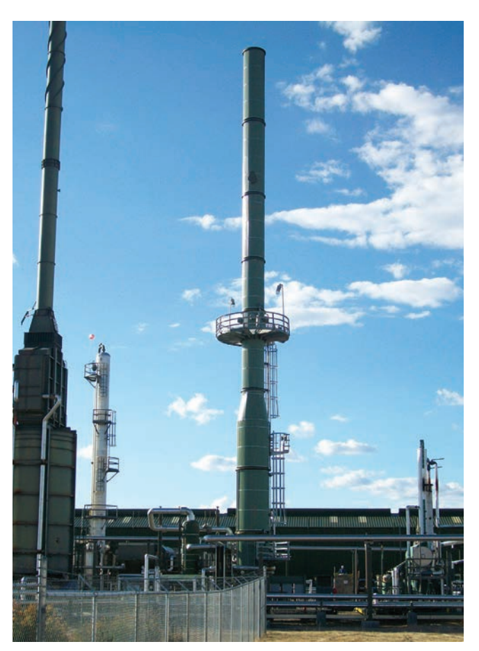
ZEECO Vapor Combustor

Choose to work with our dedicated, flexible, and innovative team, and you won't be disappointed. Call or email us today to request a quote or to learn more about our proprietary combustion systems.