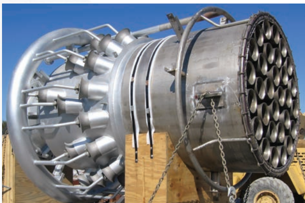
HCL Flare Tip on Truck for Delivery

BURNERS | FLARES | THERMAL OXIDIZERS | VAPOR CONTROL | RENTALS | AFTERMARKET