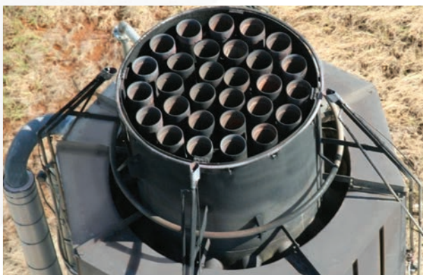
HCL Steam Assisted Flare