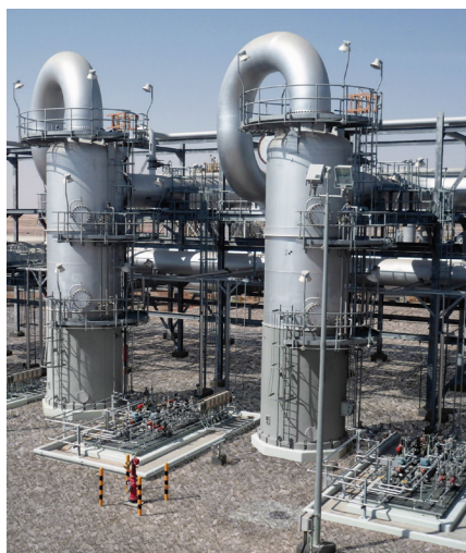
Figure 3. ZEECO deep liquid seal drums.

Flow metering of the gas to be recovered is just one part of the study. Consideration should also be given to the type of technology that will be utilised; comparing the technology's suitability in respect to the inlet and