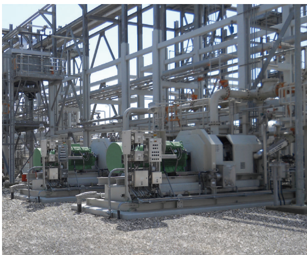
Figure 1. Example with a Zeeco flare gas recovery system.