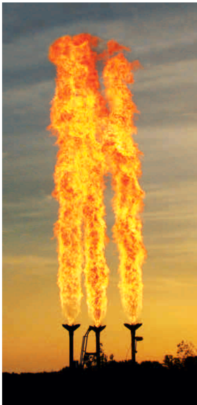
100% Xylene Testing in Zeeco's Test Facility

When you call Zeeco, we answer. When you make a request, you get a quick response. Our sales, engineering, and purchasing groups work hand-in-hand to deliver highly competitive quotes and heroic turnaround times. We stand ready and willing to travel anywhere in the world to discuss upcoming projects firsthand and to ensure every existing project runs seamlessly.