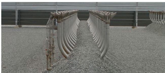
Multi-Point Ground Flare

Our only business is the combustion business. By concentrating on what we do best, Zeeco has grown into a worldwide leader in combustion solutions. We are a privately held company whose ownership stays highly involved in daily operations, with upper management comprised of the world's leading combustion experts.