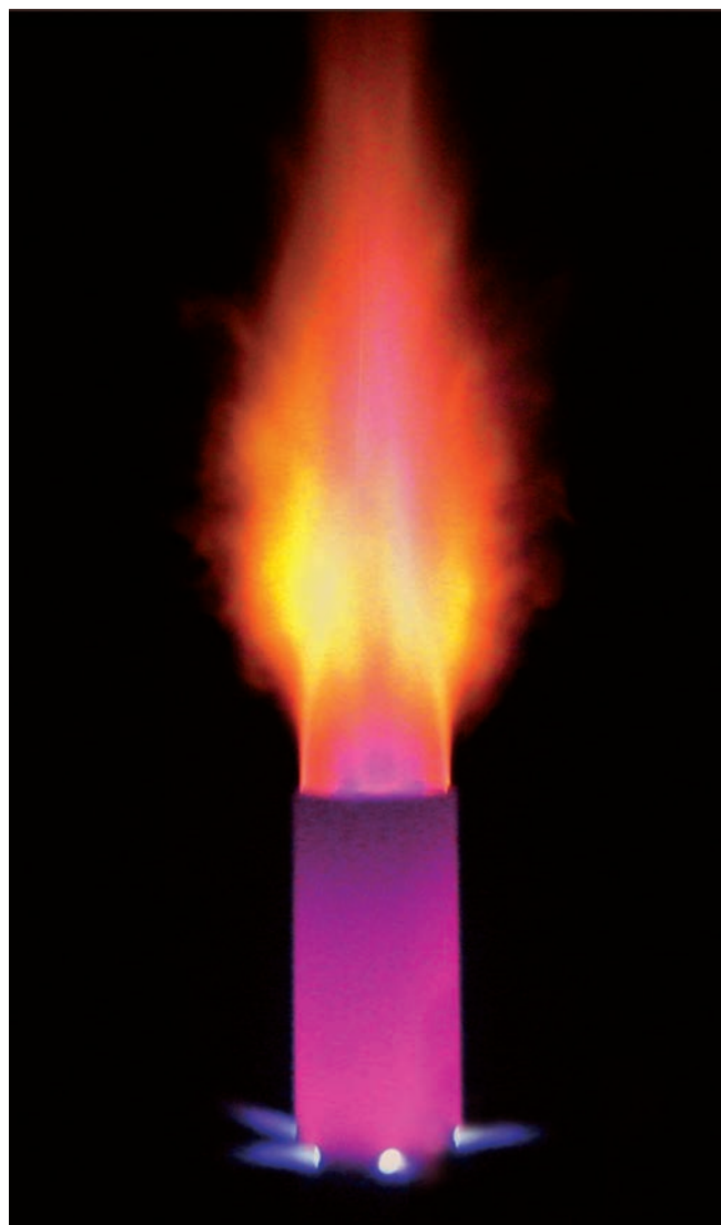
SM Series Pilot