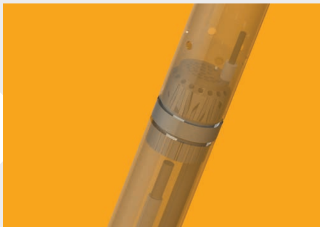
The SM Series HEI ignition and flame rod are protected from moisture by design.

When the industry demanded a pilot with moisture-proof flame detection and integrated high-performance electronics, Zeeco delivered. As the world leader in combustion solutions, Zeeco understands reliability, durability, and safety are essential for proper pilot operation. Zeeco's proprietary SM series pilot features a waterproof High Energy Igniter (HEI) for superior ignition performance. Our hermetically-sealed flame rod delivers reliable flame detection, even in the wettest environments. The flame rod is located within the pilot tip to enable the most reliable flame signal and can be operated over a wide range of fuels from 90% hydrogen to 100% propane. The junction box seals and protects all electrical connections from moisture and eliminates the need for environmentally-related electrical maintenance repairs.