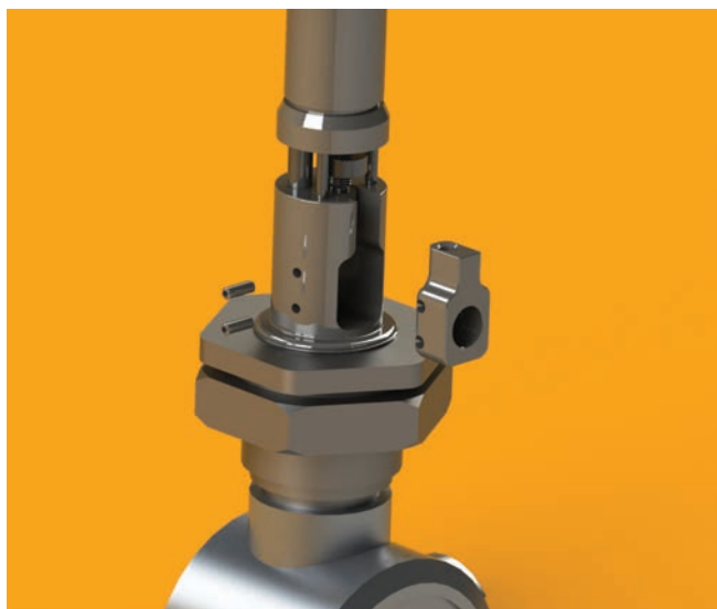
Maintenance is easy with the SM Series removable spud holder.