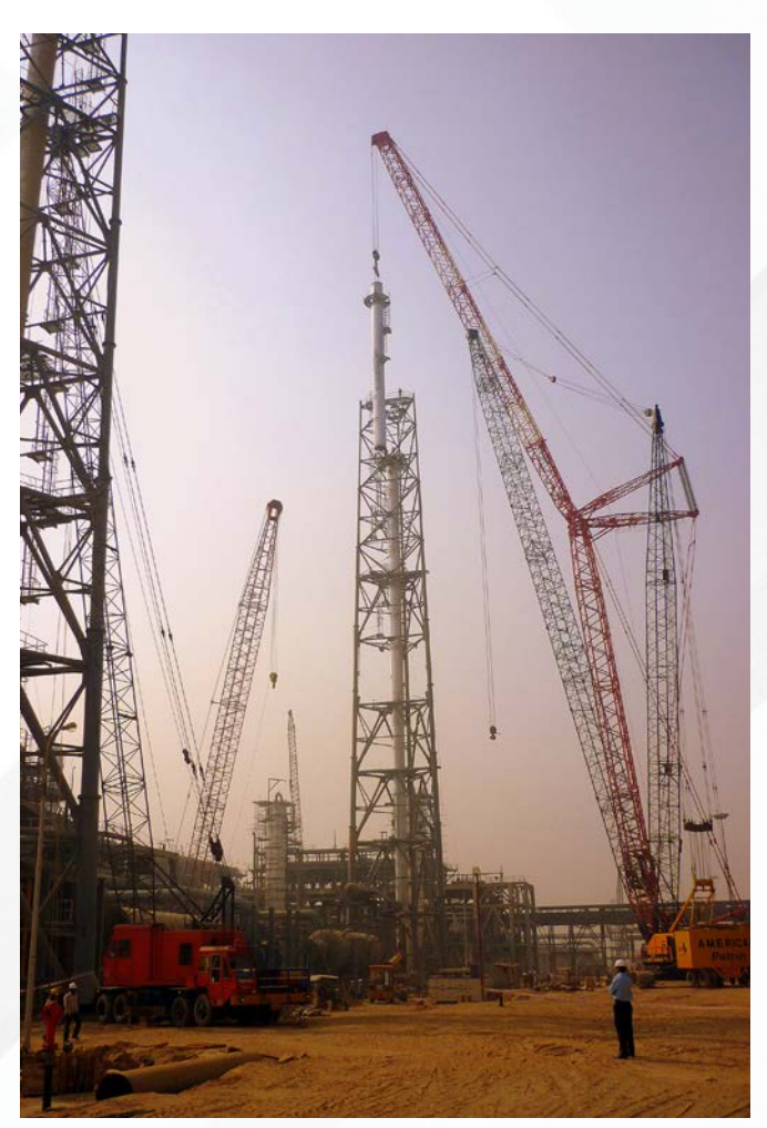
Derrick-Supported Stack Installation