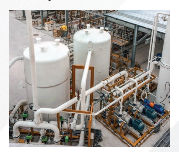
ZEECO® Vapor Recovery Unit