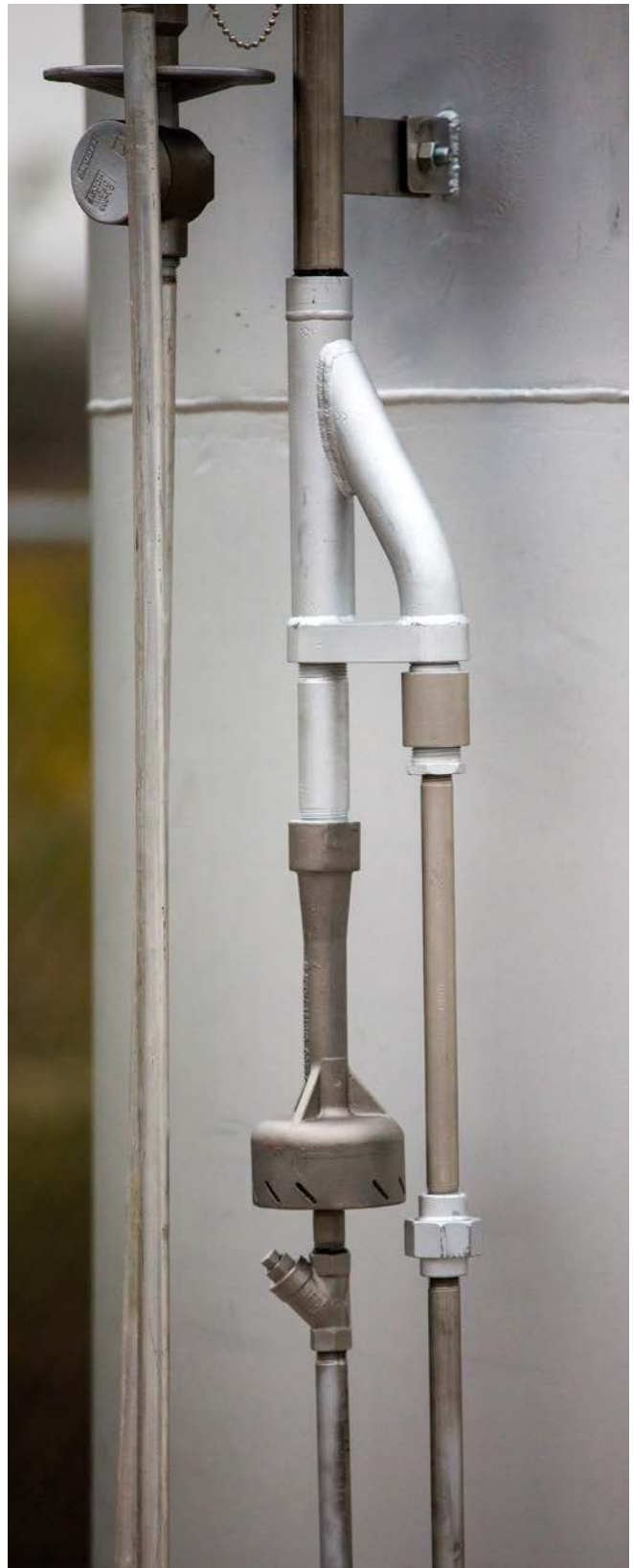
VerifEye™ Fiber Optic Flare Pilot Monitoring System

Choose to work with our dedicated, flexible, and innovative team, and you won't be disappointed. Call or email us today to request a quote or to learn more about our proprietary combustion and monitoring systems.