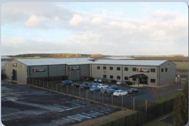
Zeeco Europe Ltd.

Zeeco is the global leader in combustion and environmental solutions for the refinery, production, petrochemical, power, pharmaceutical, and biogas industries. With more than 35 years of industry experience and a worldwide footprint of built-for-purpose manufacturing facilities, Zeeco's reputation for excellence in engineering, reliability, and integrity sets the industry standard. ZEECO® product lines include ultra-low emission burners, gas and liquid flaring systems, and hazardous and non-hazardous waste incineration.