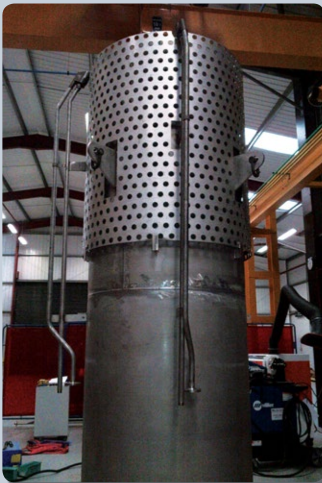
ZEECO Utility Flare

Zeeco Europe supplies aftermarket parts for our own equipment and that of our competitors. Our customers never have to settle for merely replacing technologies, because in many cases we can provide better-than-OEM solutions. In addition, we offer start-up, commissioning, inspection, and training performed by our own highly-trained, industry-accredited service engineers. We audit all sub vendors for quality, health, and safety compliance, and only those vendors who pass our rigorous criteria make the Zeeco approved vendors list.