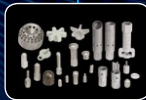
PARTS & SERVICE