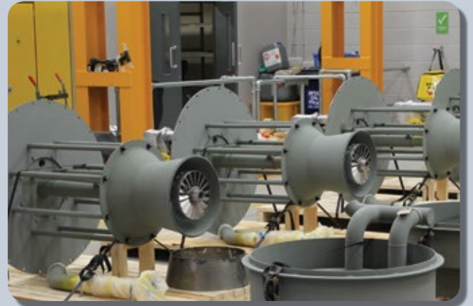
Free-Jet Ultra Low NOx Boiler Burners