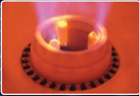
ZEECO® GLSF Free-Jet Burner