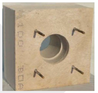
ZEECOLITE Cold Face