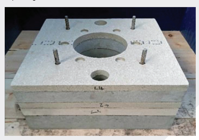
Assembly of Insulation

The ZEECOLITE tile meets fundamental criteria for consistent burner performance, energy efficiency, and firebox reliability over a long service life. The onepiece modular design uses a specially-formulated 62% alumina low ferric oxide low cement castable as the hot face, backed by low mass ceramic fibre insulation boards to achieve excellent thermal efficiency, erosion resistance, and reduced weight. The tile assembly is self-supporting with a four-point 310 stainless steel embedded anchoring system used to attach the tile module to a furnace casing or a burner mounting plate. While traditional tiles use exposed side and bottom cleat fixings, prone to metal fatigue and oxidisation, the robust anchor system of ZEECOLITE is completely independent of the surrounding furnace refractory and the combustion components of the burner system. The positioning of the anchors can be changed to suit any radiant wall burner design. In a recent case study, replacing conventional castable tiles with ZEECOLITE