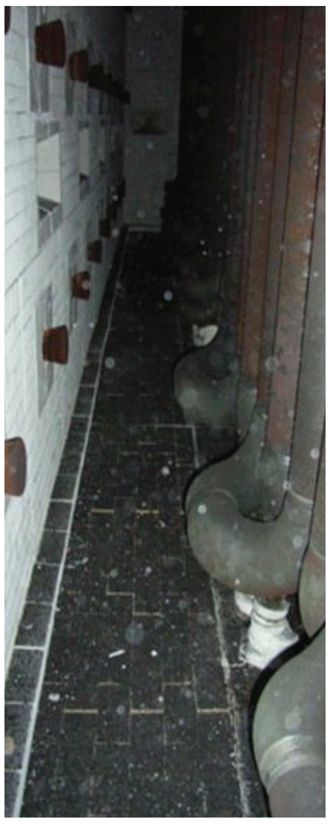
ZEECOLITE™ Tiles in an Ethylene Application