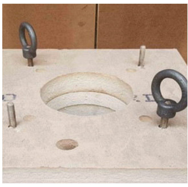
Eye Bolt Lifting Aid

The ZEECOLITE burner tile module is designed for quick and easy installation either directly to a furnace casing or to a burner mounting plate for both new and retrofit applications. The four embedded anchors suspend the ZEECOLITE module without any movement due to the gravitational torque, relieving load/stress to the surrounding lining system of the furnace. If the anchor bolt pattern does not match the existing arrangement on the furnace mounting plate, additional holes can be drilled in the mounting plate using a template board. To assist with installation, we can provide eyebolts that thread onto the anchor bolts to support the weight of the tile whilst it is guided into the fully installed position.