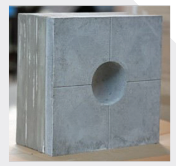
ZEECOLITE Hot Face

By eliminating vulnerabilities common to traditional designs, the ZEECOLITE tile reduces energy, operation, and maintenance costs for operators over the duration of a proven 15-year service life. The tile is pre-dried to 360°C (680°F) to ensure removal of both free and chemical water and prevent thermal cracking or tile failure during start up procedures. Backed by energy-efficient, low mass ceramic fibre insulation boards, the fully protected anchor system inhibits forward movement of the tile in relation to the burner gas tip to ensure longevity and reliability.